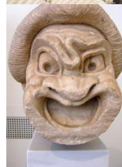
A Greek mask