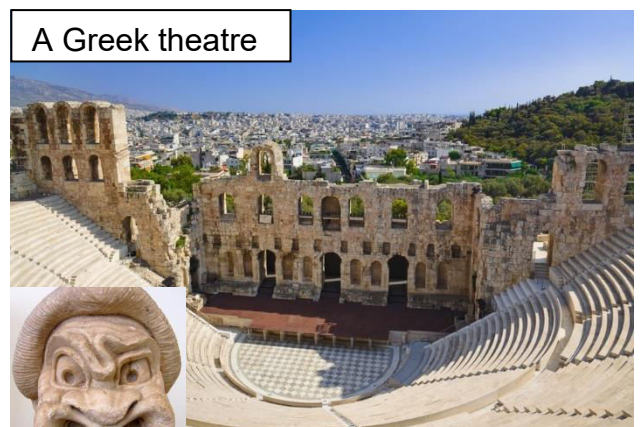
A Greek theatre