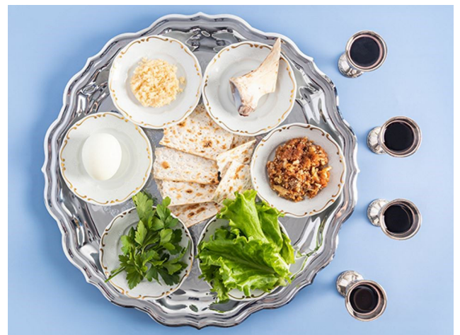
The Seder Plate. The different items symbolise parts of the story of the Passover.

Jews celebrate the delivery of the Israelites from slavery every year at Passover.